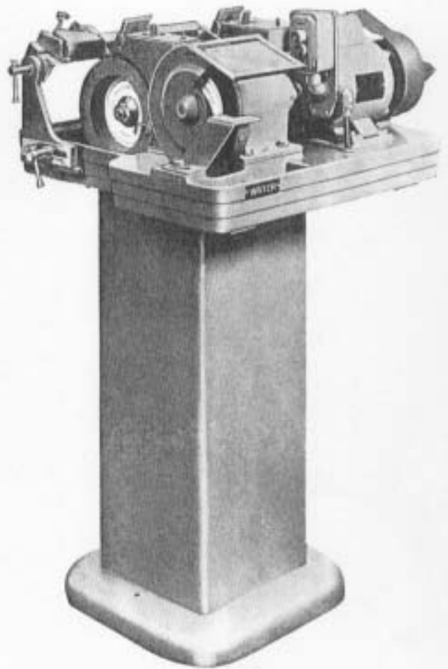
Right side view - Note Emery Wheel with Tool Rest as well as Oilstone Wheel and Tool Holder.